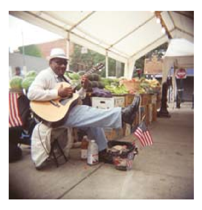
Figure 2. Findlay Market, June 2008.

The scientific community has declared anthropogenic climate change "unequivocal."<sup>11</sup> But despite its global effects, not all regions will sustain the same degree of changes. For the people of Overthe-Rhine, the modeled effects of climate change are mostly related to prolonged heat waves and the potential for punishing drought and decreased urban water quality during the summer months. Critically, though drought may occur in the summer, the severity of individual storm events is projected to increase, as is overall annual rainfall in the area. These conditions will have dramatic consequences