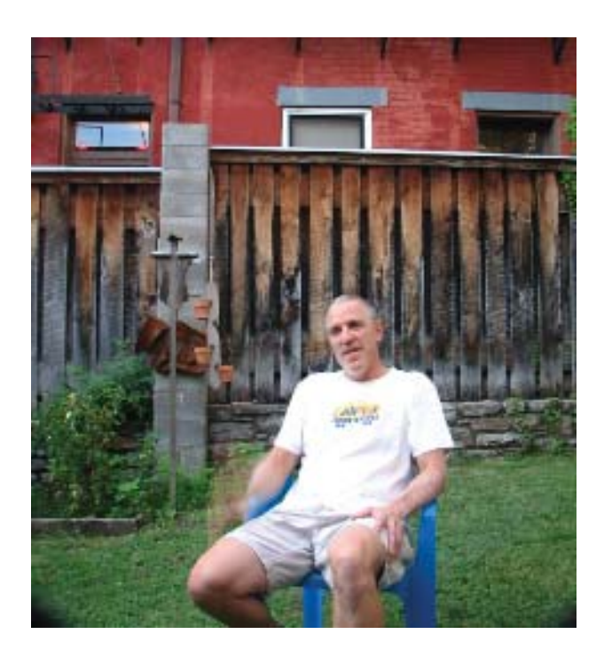
Figure 3. Pendleton, August 2008.

the increasing costs of both "dirty" coal power and automobile transportation that would accompany a cap-and-trade system, suburban land use will become largely unaffordable, and could become an economic trap for millions of Americans. Faced with the steady devaluation of their property and increasing difficulty affording individual motorized transportation to work, the value of the multi-centered inner city will rise again as suburbanites with sufficient resources begin to "colonize" the inner cities their parents and grandparents had once abandoned.<sup>16</sup>