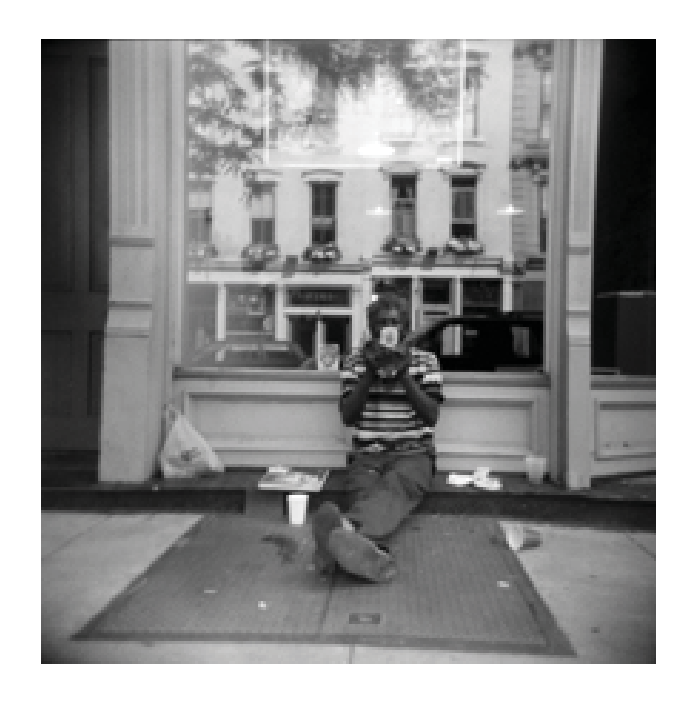
Figure 4. Main Street, July 2008.

Viewed in retrospect, the arc of the separatist battle for Over-the-Rhine that occurred between 1960 and 2001 correlates nearly precisely with the rise and peak of America's investment in a highly carbon-intensive, car-dependent suburban lifestyle. Curiously, the rate of income decentralization in US cities, a statistic that has climbed consistently since World War II, remained level throughout the 1990's, despite high economic growth.<sup>21</sup> This breaks with previous research that correlated increasing incomes with increasing rates of economic decentralization. In addition to the pressures of climate change, this could be further evidence that the suburban era is closing behind us. If true, the tide of urban re-settlement over the coming decades will likely transform the real-estate market to such an extent that the objections of Over-the-Rhine's low-income social interests will be deluged. For Over-the-Rhine's residents, commencing with